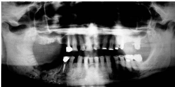
FIGURE 4. Osteolysis of the mandible with a pathologic fracture resultant from a tooth removal while the patient received pamidronate bisphosphonate therapy.

Marx et al. Bisphosphonate-Induced Exposed Bone of Jaws. J Oral Maxillofac Surg 2005.