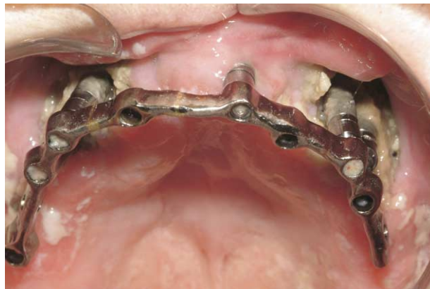
FIGURE 8. Dental implants in the jaws in patients receiving pamidronate or zoledronate risk implant loss and bone exposure as in this case.

As soon as the treating oncologist prescribes bisphosphonate therapy, the patient should be referred to an experienced dentist or oral and maxillofacial surgeon for an urgent examination. Close and ongoing communication between the 2 is crucial, and commencement of bisphosphonate therapy should be deferred until dental and oral surgical treatments have been completed. At the minimum, the dental examination should consist of clinical and panoramic radiographic examinations with individual periapical films where indicated. Dental treatment is aimed at eliminating infections and preventing the need for invasive dental procedures in the near and intermediate future. This may include tooth removal, periodontal surgery, root canal treatment, caries control, dental restorations, and dentures. These patients should