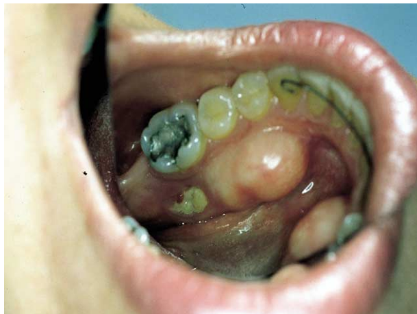
FIGURE 6. Mandibular tori represent an anatomic comorbidity. Seen here is exposed bone related to zoledronate therapy over a multi-lobulated mandibular torus.