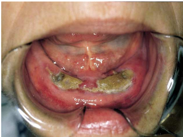
FIGURE 1. Exposed necrotic bone in the mandible related to pamidronate.

Marx et al. Bisphosphonate-Induced Exposed Bone of Jaws. J Oral Maxillofac Surg 2005.