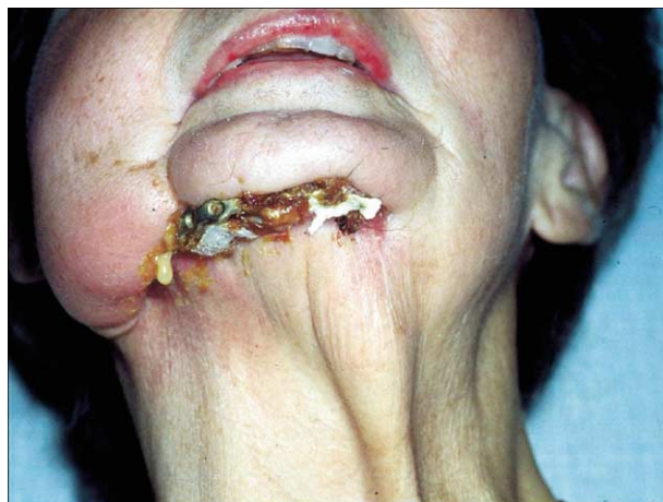
FIGURE 3. Significant cutaneous tissue loss with protruding bone and titanium plate with secondary infection as a result of attempted surgery to debride bisphosphonate-related osteonecrosis of the jaws.

The mandible and maxilla were the only bones involved in these exposures. Eighty-one exposures (68.1%) occurred exclusively in the mandible, 33 (27.7%) exclusively in the maxilla, and 5 (4.2%) simultaneously in the mandible and maxilla. The posterior mandible in the area of the molars was the most common site of exposure ( n = 78 ; 65.5%), followed by the posterior maxilla ( n = 27 ; 22.7%).