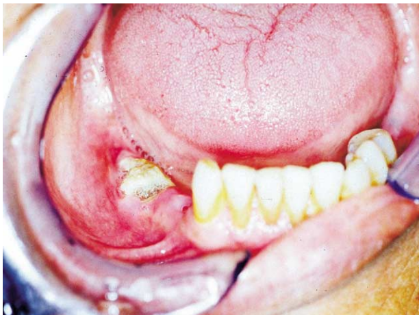
FIGURE 7. A nonhealing extraction socket such as this is a common complication when teeth are removed in patients receiving pamidronate or zoledronate therapy.

Marx et al. Bisphosphonate-Induced Exposed Bone of Jaws . J Oral Maxillofac Surg 2005.