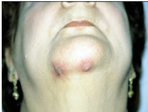
FIGURE 2. Draining oral cutaneous fistulas representing secondary infections from an exposed mandible in the oral cavity from zoledronate.